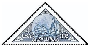
Sailing Ship — A2420

The U.S. issued its first triangular stamp in 1997 and since then has issued stamps in all kinds of shapes and sizes.